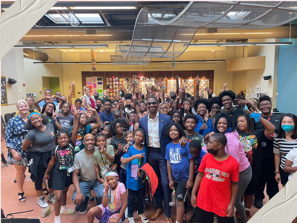
Rainey Campers with Mayor Bibb Summer Camp 2022